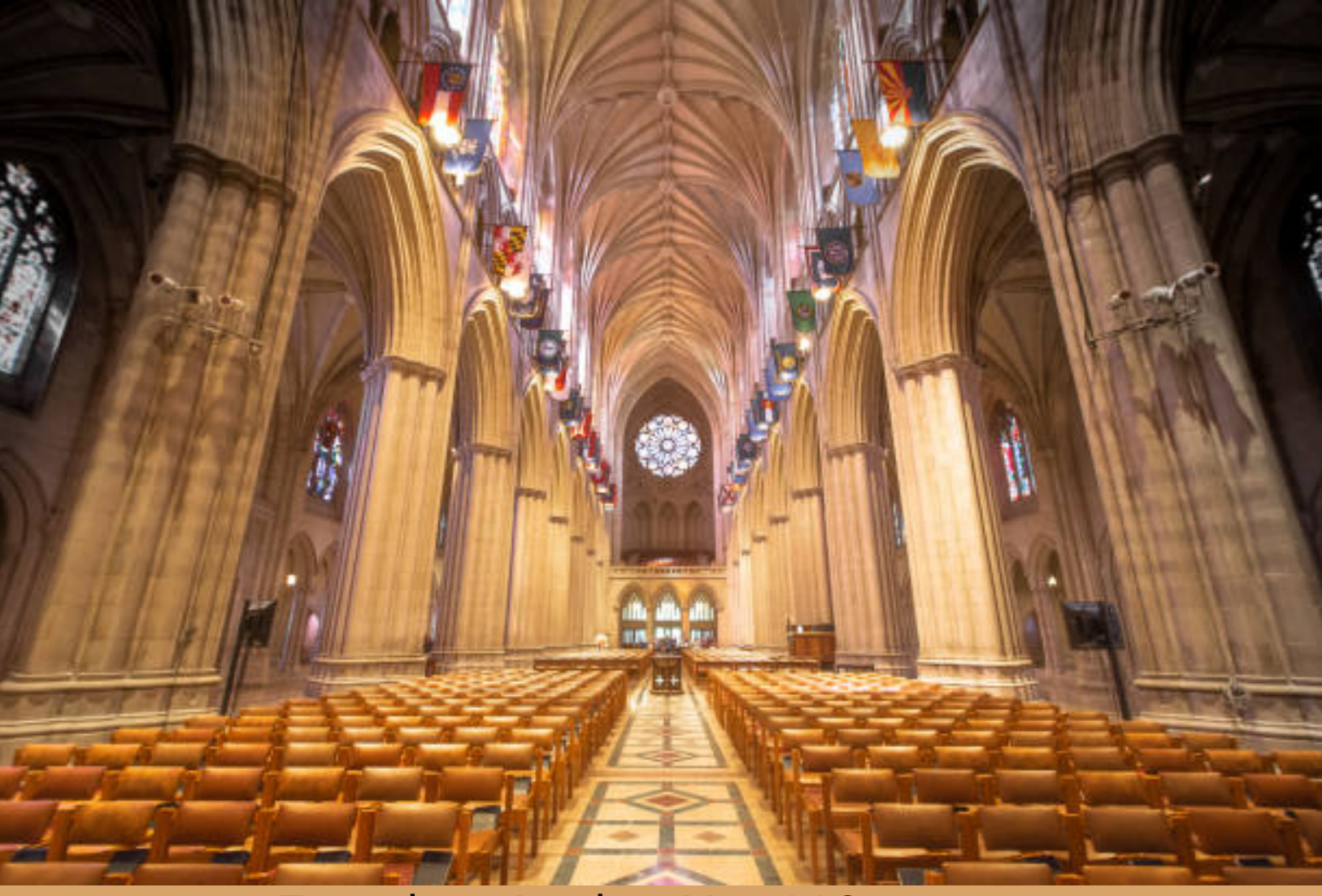
Freedom Lodge No. 118 goes to Washington National Cathedral Saturday, June 15th