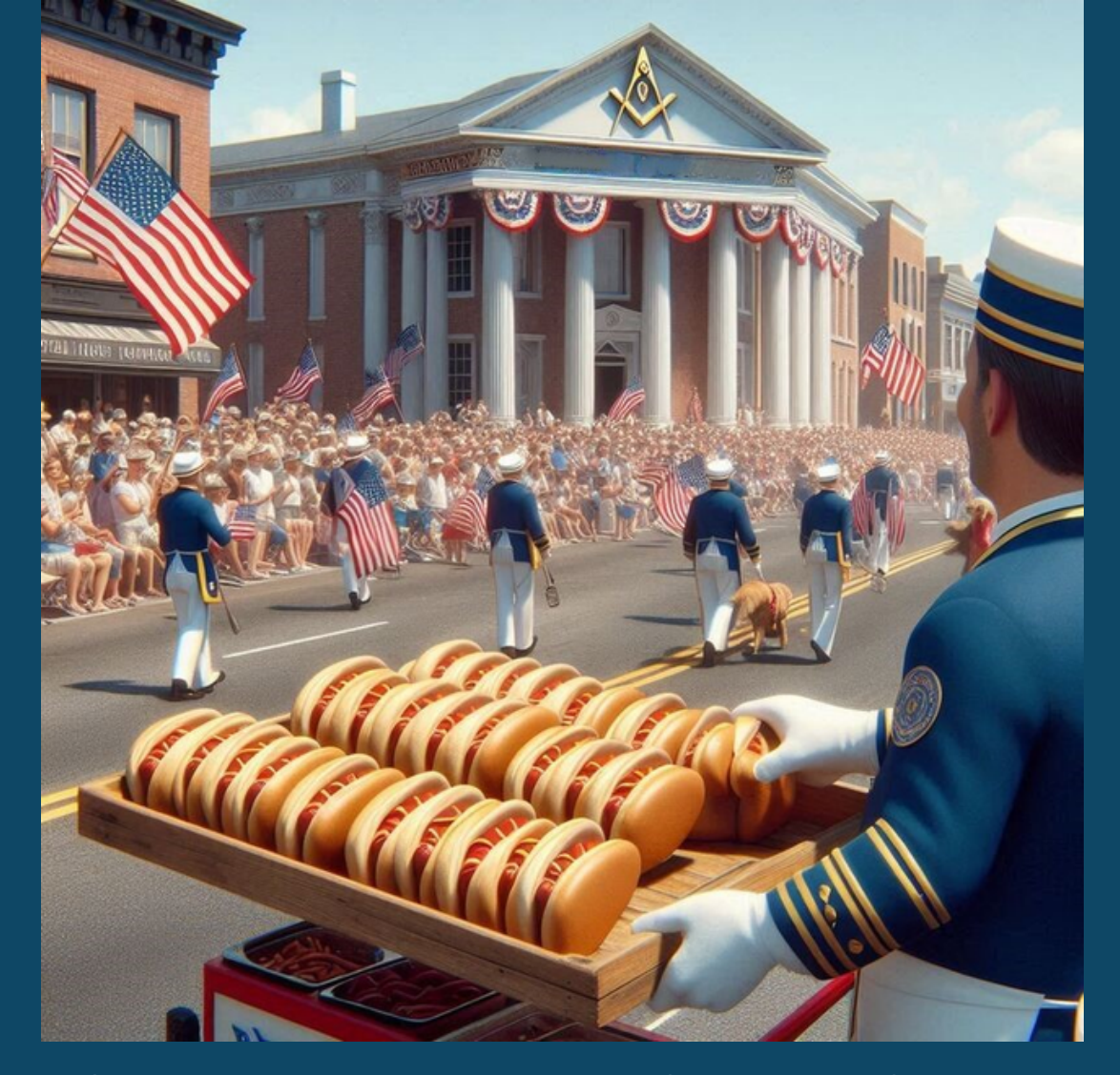
LOVETTS VILLE IN DEPENDENCE DAY CELEBRATION WEDNESDAY, JULY 3RD

We want YOU to participate in representing Freedom Lodge to our community!